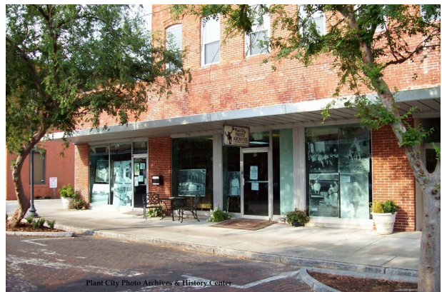
Plant City Photo & Archives Building

It has been a fascinating 13 years and the world of archives, museums, libraries, and history centers has become a challenging and rewarding one with never a dull day.