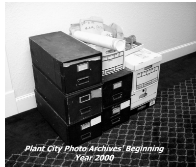
Photo Archives seed was planted. A 501 (c) (3) Florida not-for-profit corporation was founded in 2000.

The historical society passed on the opportunity to acquire the photo collection and the Plant City