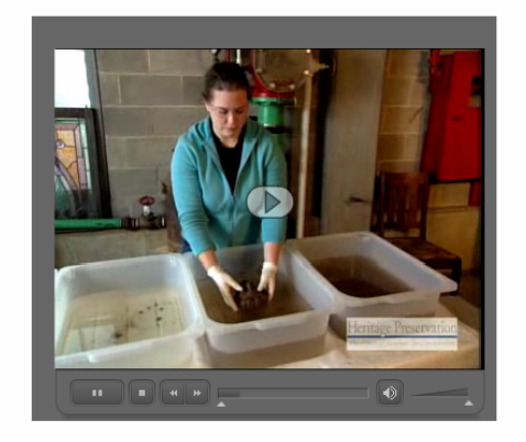
The award-winning Field Guide to Emergency Response helps museums, libraries, and archives cope when disaster strikes. The

This 10-minute video provides step-by-step guidance on dealing with water damage at museums, libraries, and archives. Practical tips on safety, simple equipment, and salvage priorities also make the video a useful guide for home owners who want to rescue treasured family heirlooms.