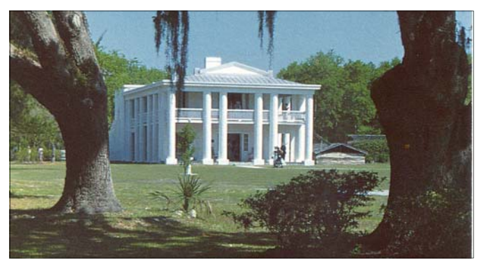
Gamble Mansion in Ellenton, near Bradenton.