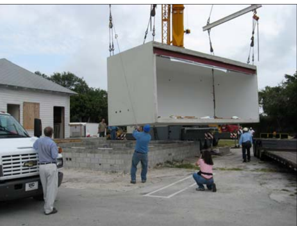
The Archives Bunker

The former living, dining room and porch of the house will be an open space available for a portable classroom, lectures, tours and receptions. One room will be a conference room where information from the archives storage can be wheeled in on a cart for research at the conference table. Also in the conference