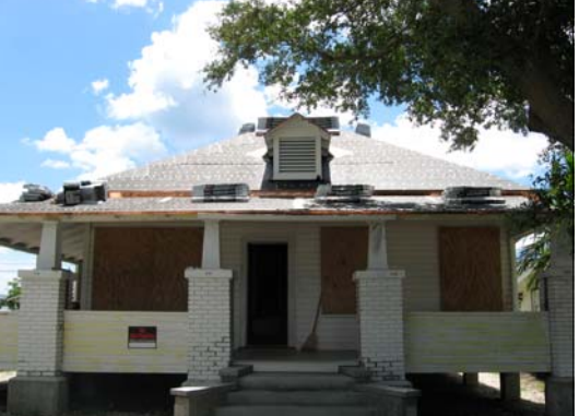
The Hunt House before construction, above, June 17, and after, below, October 3, 2008.

Antiques Show & Sales and planned a Capital Campaign. In addition approximately $500,000 was raised from the Delray Beach CRA, the City of Delray Beach, the Palm Beach County Board of Commissioners and State of Florida Division of Historical Resources and the Palm Beach County Cultural Council.