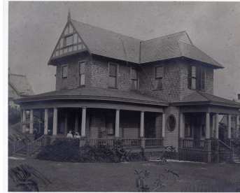
Charles Chilingworth homes, est. 1903. Site of the Current Harvey Building.