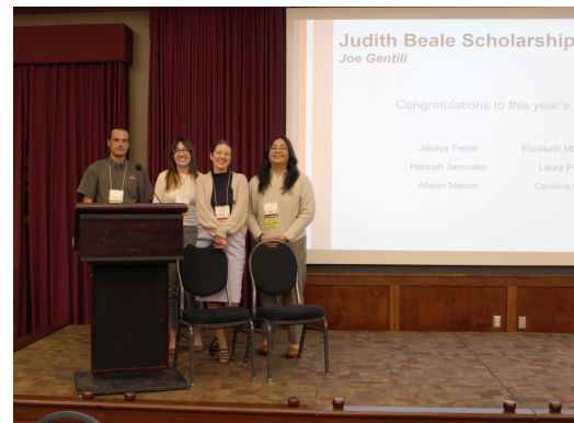
2023 Judith Beale Travel Scholarship Recipients, SFA Annual Meeting